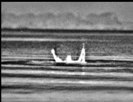
Person in water waving for help